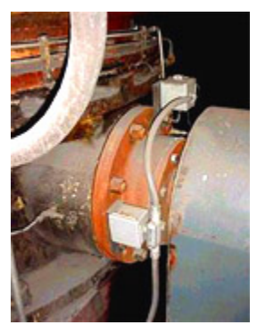
The photo above shows how SWAN sensors are placed for monitoring heavy equipment.

Stress Wave Analysis (SWAN<sup>™</sup>) technology easily identifies gear damage on machinery operating at low speeds as shown in the following rolling mill gearbox test. The rolling mill gearbox has an input pinion speed of 175 RPM and an output shaft speed of about 14 RPM. The input pinion gear has a 32 inch pitch diameter, and the output gear has a pitch of 16 feet. A previous diagnostic effort using vibration measurement had been unsuccessful, since the low speed and large mass of the machine resulted in extremely low level housing motion (vibration). However, measurement of the Stress Wave Energy (SWE) indicated that the input pinion bearing read more than ten times as high as the same type of bearing on the opposite end of the same shaft. Spectral Analysis indicated not only outer race damage to the suspect bearing, but also tooth damage on the input pinion gear. This gear tooth damage was also verified by visual inspection.